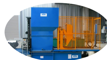
OPTION: BIN LIFTER

We reserve the right to make changes to specifications without prior notice. Bale weights are dependent upon material type.