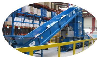
OPTION: CONVEYOR BELT