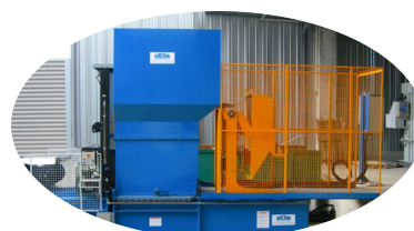
OPTION: BIN LIFTER

We reserve the right to make changes to specifications without prior notice. Bale weights are dependent upon material type.